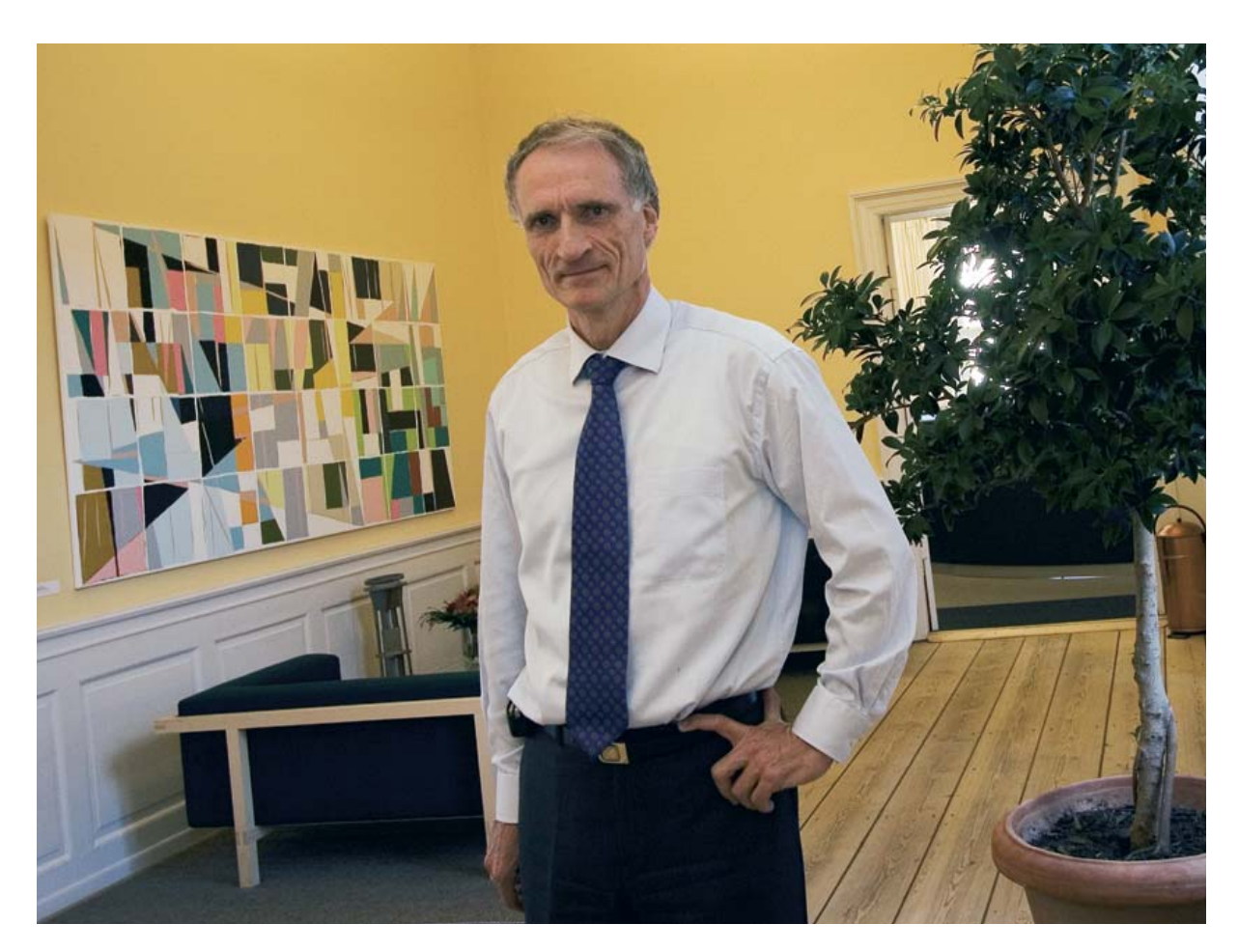
Bertel Haarder, Minister for Education